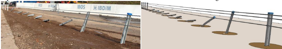
FIGURE 1. Comparison of the results obtained from full-scale crash test (left side) and numerical simulation (right side)

The main objective of this study is to derive and to validate numerical model based on the results from full-scale crash test. Afterwards this model was used to conduct the double-impact simulation. The first 1500-kg vehicle struck the barrier at a velocity of 110 km/h at 7 degrees, the second car impact the barrier into the same place and with the same velocity, but the impact angle was set to 20 degrees. FIGURE 1 presents a comparison of damages arising in the experimental test with the result from simulation. Simulations were conducted using LS-DYNA R8.1.0 code.